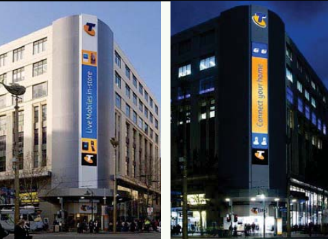
TELSTRA - MELBOURNE - OUTDOOR LED VIDEO SCREEN - 25MM PITCH / 40M 2