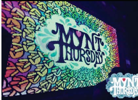
MYNT LOUNGE - WERRIBEE - INDOOR LED VIDEO SCREEN - 7.62MM PITCH