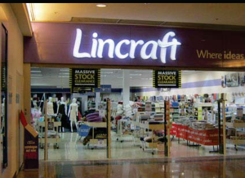
LINCRAFT - PENRITH - LED ILLUMINATED 3D LETTERING