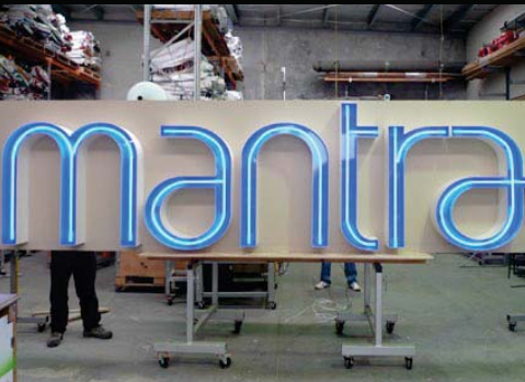
MANTRA - JOLLIMONT - LED NEON SKY SIGN