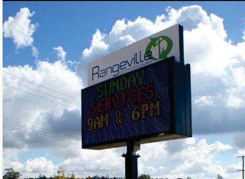
RANGEVILLE - TOOWOOMBA - OUTDOOR LED MESSAGE SIGN - 20MM PITCH / 4.6M 2